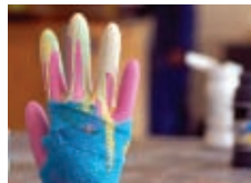
The Artists First Studio at Spike Island.