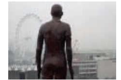
An Antony Gormley figure on London's South Bank, 2007.