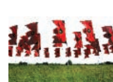
Flag installation by Angus Watts, part of The Water Margins, 2008.