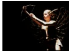
Underground by Slung Low.