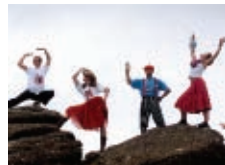
Big Dance on Dartmoor, 2006.