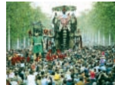
The Sultan's Elephant , a production by Artichoke, 2005.