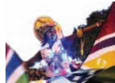
The Night Carnival featuring Kinetika Bloco dancers at the Mayor's Thames Festival, 2007.