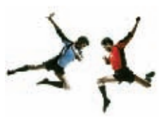
Bend it... by Srishti at Greenwich+Docklands International Festival, 2008.