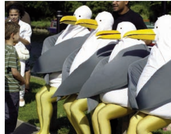
The Water Margins, 2008.

The Water Margins was a great start to what promises to be a lasting cultural legacy for the Lee Valley.