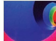
Interior view of Colourscape.