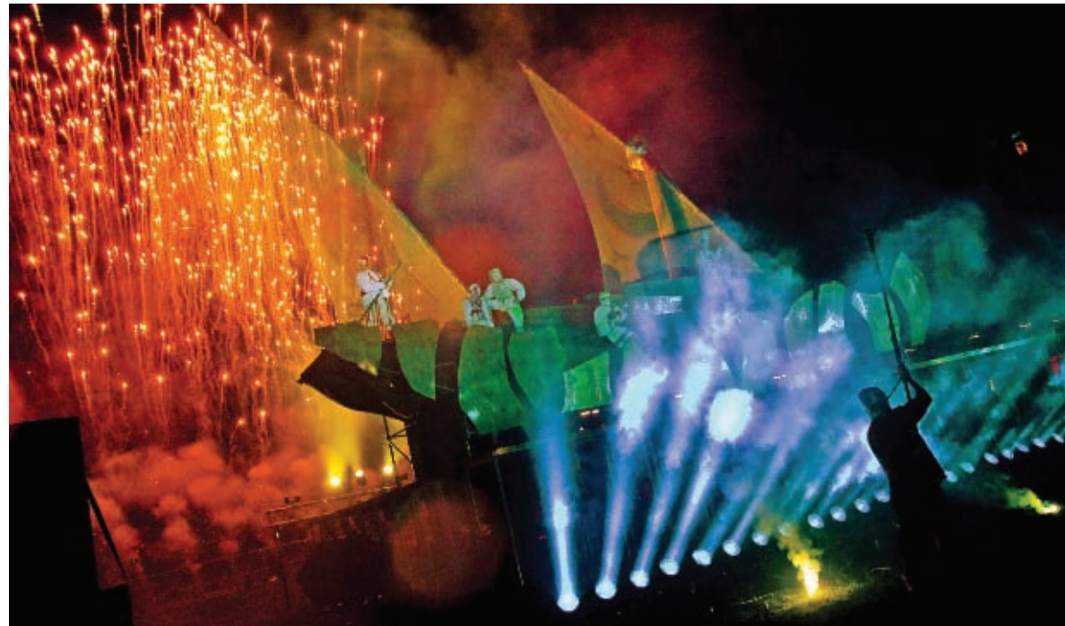
Veles e Vents by Xarxa Teatre, part of Inside Out, 2008.

landscape, food, fashion, creative and sporting excellence. Exciting high profile events such as Inside Out that bring culture to everyone are a core part of our vision.'