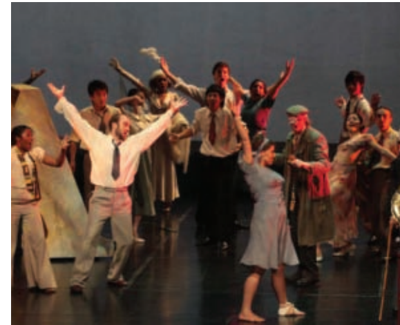
The National Youth Theatre perform The Merchant of Venice in Beijing, 2008.

The National Youth Theatre are a regularly funded organisation based in London.