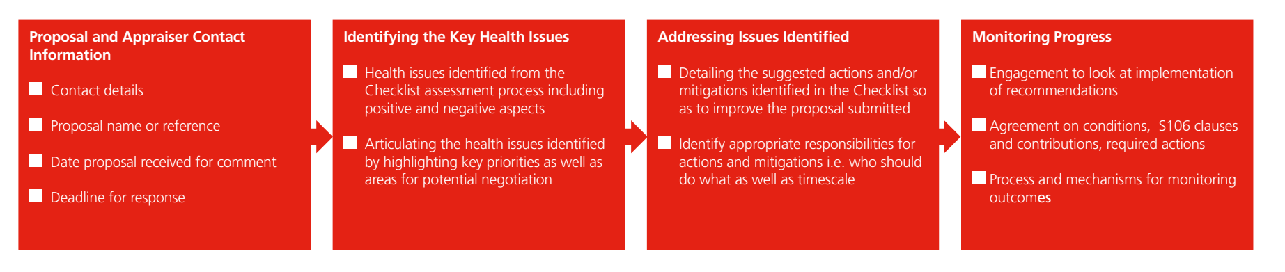
Figure 1: Response framework

Within the response framework you should outline potential negative consequences for health if the actions or mitigations outlined are not implemented, further you should- assess what the key priorities are i.e. critical issues of health concern and those for possible negotiations. Relevant actions may include conditions imposed on planning applications and Section 106 agreements in terms of funding for mitigation related to the impact etc. Once the actions and