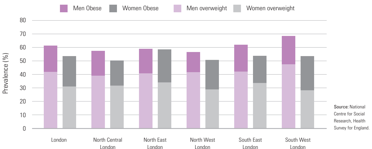
Figure 2 Prevalence of overweight and obese adults by sex and area, London 2000-02